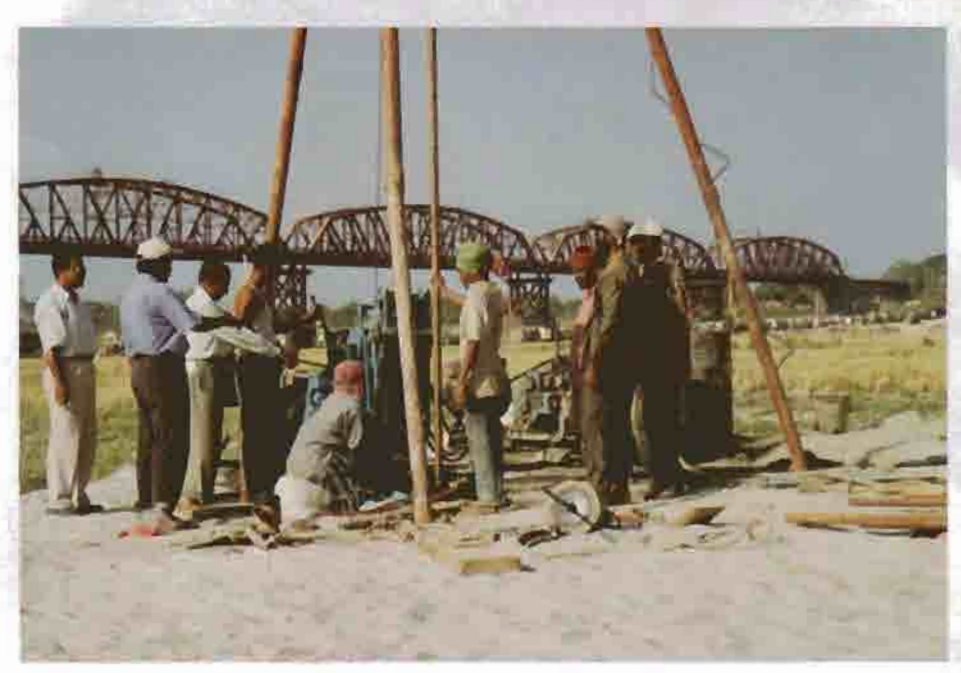
Exploratory Bore Holes by use of Rotary Drill Rig on Land at Paksey Bridge Construction Project.