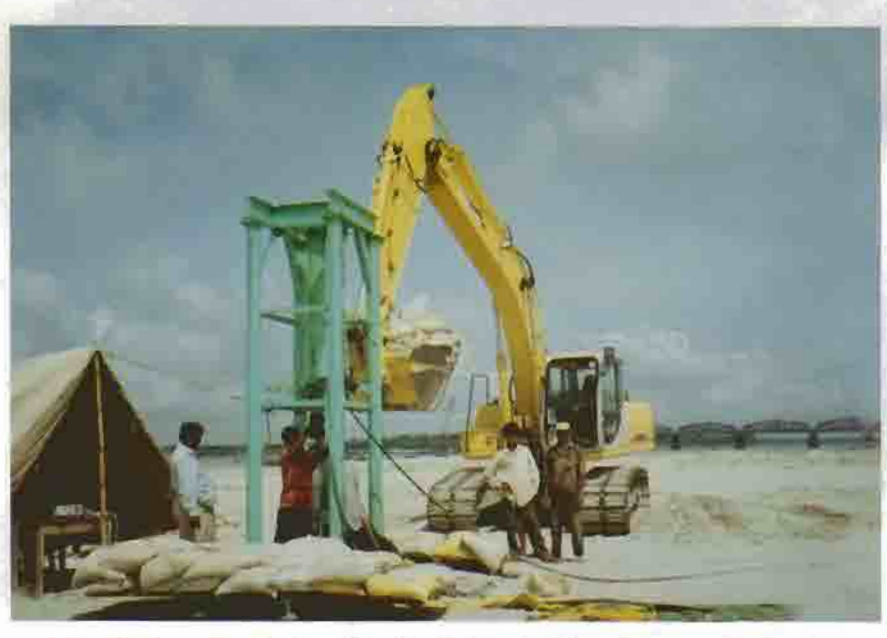
Electric Cone Penetration Test for Paksey Bridge Construction Project.